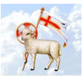
"Behold, the Lamb of God, who takes away the sin of the world!